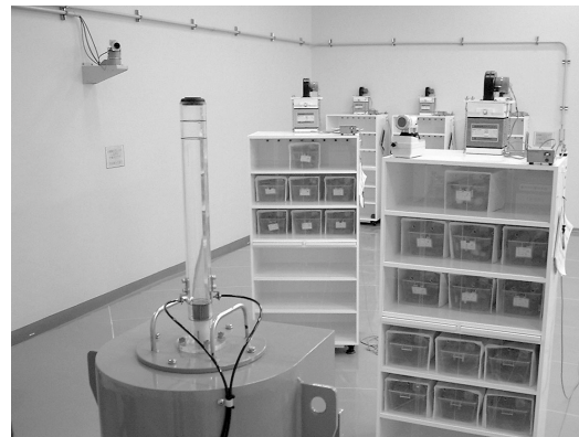
Figure 1. Long-term low-dose-rate irradiation facility

Irradiation with low-dose-rate gamma rays was carried out in a clean irradiation room (Figure 1) equipped with a 137 Cs gamma-ray source (370 GBq). The dose rates at 5, 7 and 10 m from the source were 1.2, 0.70 and 0.35 mGy/hr, respectively. The irradiation was continued, except for 1 hr intermissions in the morning on weekdays for care and examination of the mice. The design of the irradiation facility and the details of dosimetry with the ionization chamber and glass dosimeter have been described elsewhere 8 .